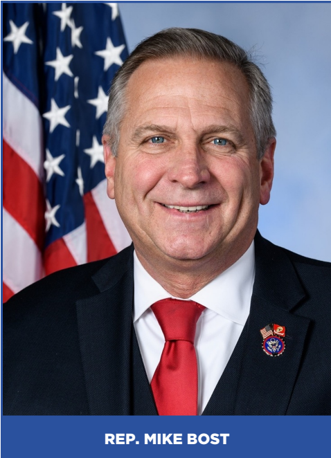
REP. MIKE BOST